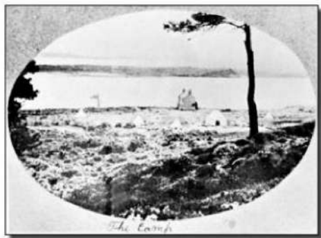
Postcard of the first Scout encampment at Brownsea Island (August 1907)