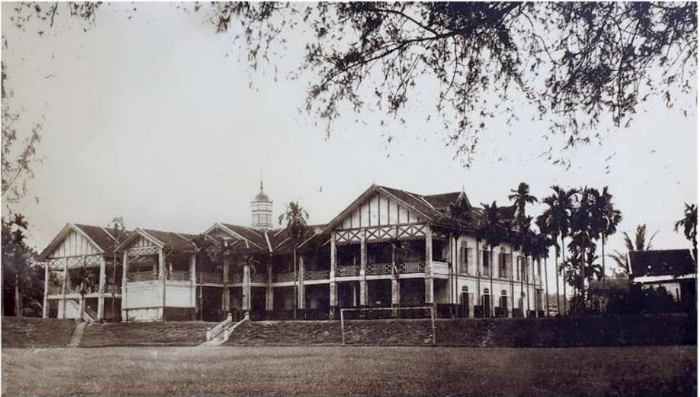
Methodist Boys School, Davidson Road (now Jalan Hang Jebat), Kuala Lumpur, 1904

Although running in parallel, both Troops were well aligned in terms of colour of uniforms and training programmes, based firmly on B-P's Scouting tenets.