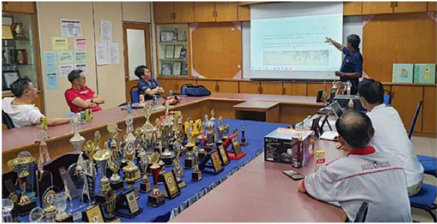
Project update briefing and endorsement to the 10th KL Scout Leaders' Council at MBSSKL's Boardroom (13 August 2022)