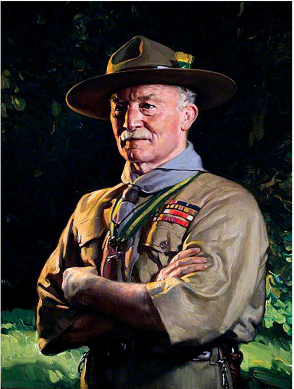
A popular picture of the Founder of the Scouting Movement, Lord Baden-Powell of Gilwell

https://en.scoutwiki.org/Robert_Baden-Powell https://en.wikipedia.org/wiki/Brownsea_Island_Scout_camp