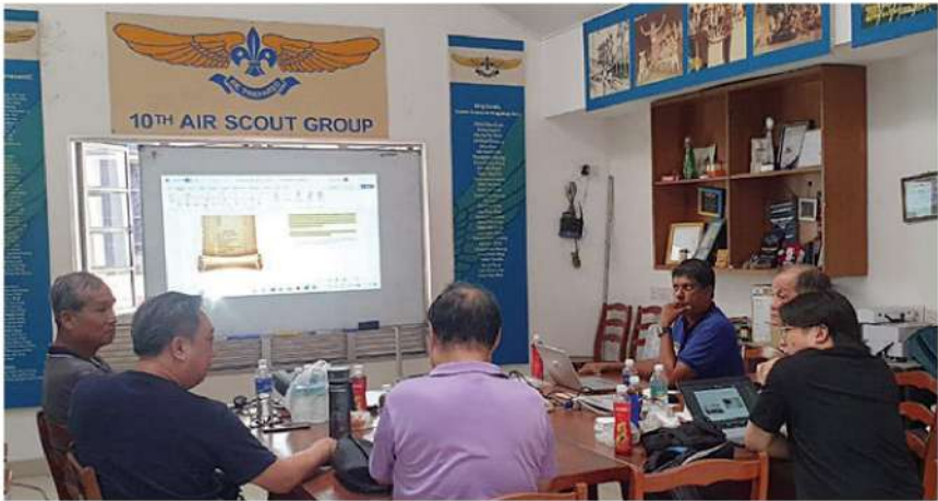
(Above and below) Publication Team's First Meeting at KC Den (16 September 2023)