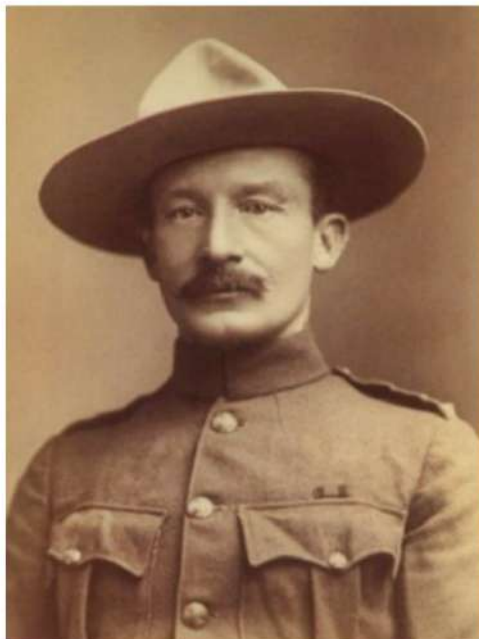
Robert Baden-Powell in 1896

From that moment onwards, the Scouting spirit radiated steadily outward throughout the British colonies, appearing on the shores of Malaya around the 1910s.